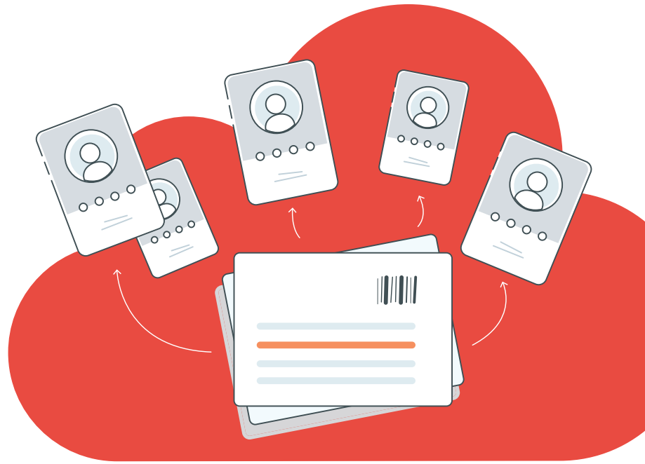
Automated file and data sharing

Compress, duplicate, move, more efficiently