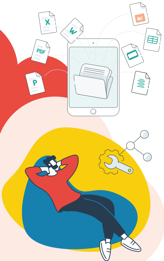
True 'hands off' automation with a level of flexibility and cost efficiency unique to the market.