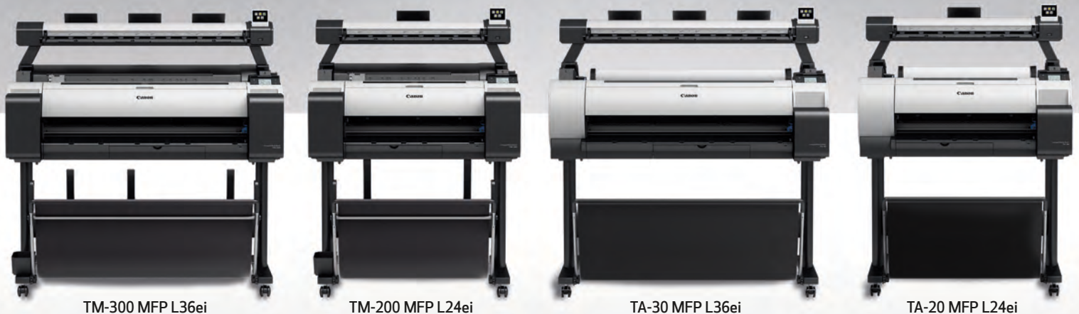
TM-300 MFP L36ei

Free Layout Plus: Nest, tile, and create custom layouts before printing your files with this print utility. Use the Plug-in feature to print directly from Microsoft office programs.