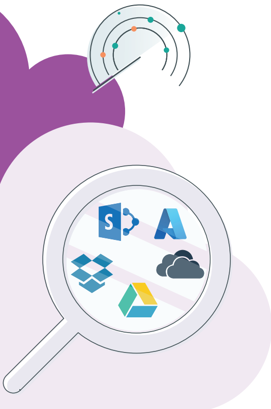
↳ Connect all of your existing/ on-premise storage & link to all cloud storage providers